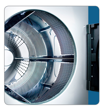
EXCLUSIVE DESIGN FEATURES