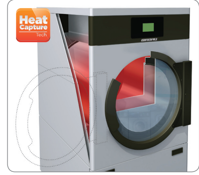
HEAT CAPTURE TECHNOLOGY & REVERSIBLE DOOR