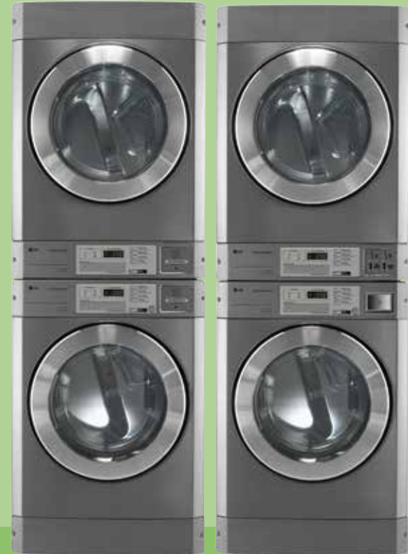
GD1329CGD2 – Card-Operated Dryer (gas), Lower Stack