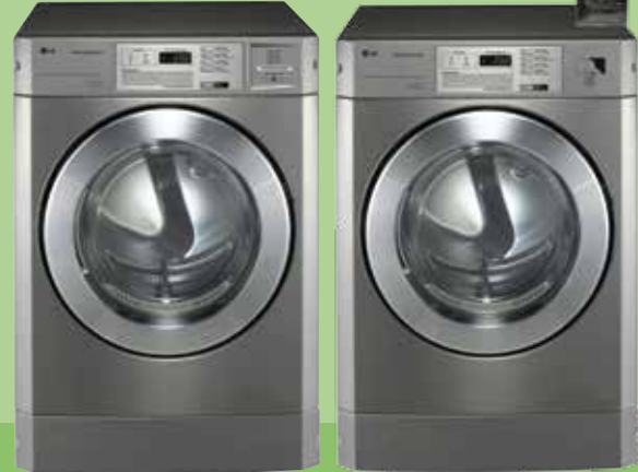
GD1329CGS2 – Card-Operated Dryer (gas)