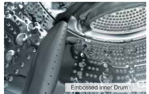
Embossed Inner Drum