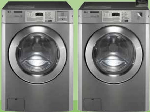
GCWP1069CS2 – Card-Operated Washer