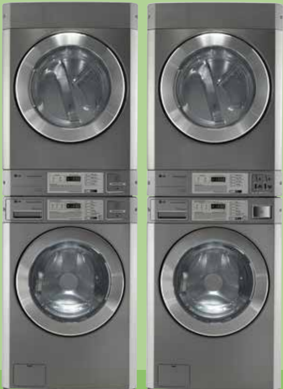
GCWP1069CD2 – Card-Operated Washer, Lower Stack