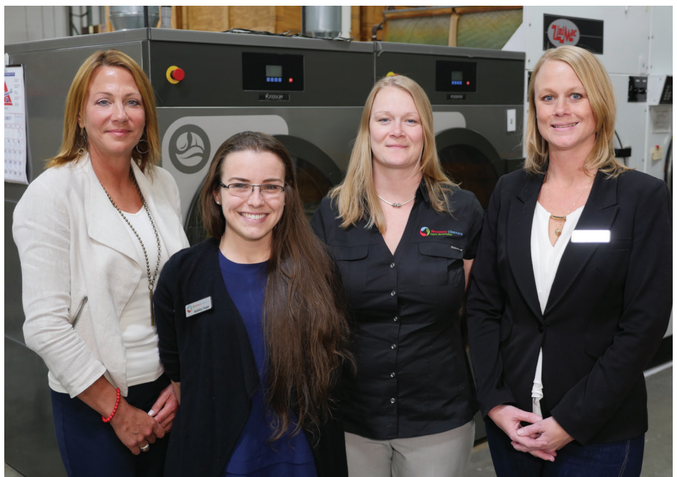
The Recovery Cleaners team recovers and restores garments damaged by fire and floods with help from its Poseidon Textile Care System.

“Here at Recovery Cleaners, we are always staying ahead with leading edge technology,” added Schaefer. “Our commitment to quality and earth-friendly processing is what brought us to the Poseidon Textile Care System. Wet cleaning is often more effective than dry cleaning when it comes to removing soot, odors and fire pollutants.”