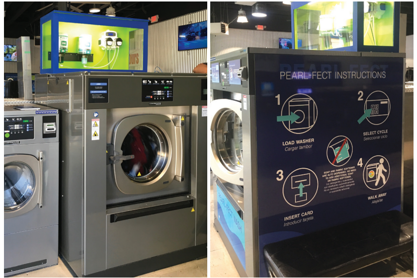
Pearl Laundry added a 90-pound capacity washer with automatic chemical injection shortly after it opened. To help market the concept inside the store, a clear cabinet and lighting is used to showcase the automatic injection feature.

In general, larger capacity washers with programmable controls and the ability to offer a la carte cycles, as well as ozone and automatic soap/softener injection, can attract new customers, retain existing customers and diversify and increase revenue streams. They also allow you to expand into new markets while minimizing major infrastructure improvements.