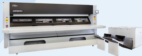
FR+ - Multi-lane Folder/Cross Folder STACKER - FR+1AP or FR+2AP