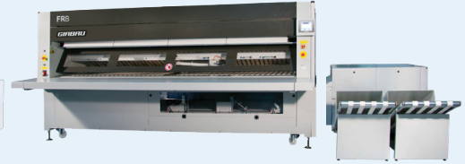
FRB - Multi-lane Folder/Cross Folder STACKER - APB1 or APB2