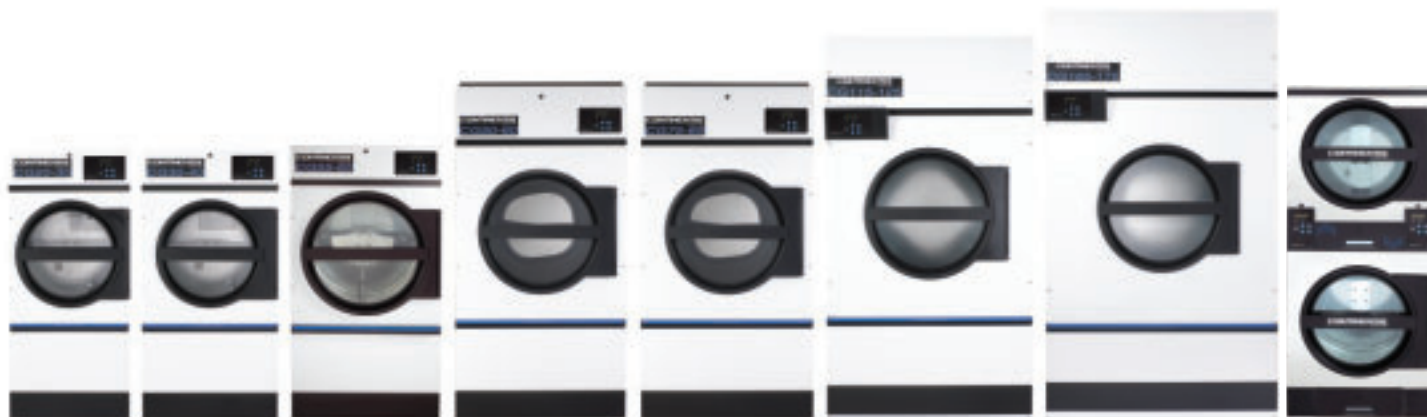
Pro-Series II Drying Tumblers

An economic, compact and productive folder, it quickly and accurately folds small- and large-scale items including hand towels and full size bath towels. Items are manually fed onto a feeding table for rapid and accurate folding and stacking. The FT-LITE folder automatically stacks items according to established program settings. The control offers an easy-to-use touch-screen display that delivers total control over the folding and stacking of multiple items. Each of the programmed items can be folded according to a variety of specifications, including primary- and secondary-fold options.