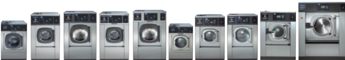
M-Series Hard-Mount Washer-Extractors

GREEN FOCUSED Offering green-engrained features that conserve water, energy and natural gas, Continental Girbau Washer-Extractors offer advanced technologies and deliver superior wash quality using considerably less water. A sump-less design, exclusive AquaFall™ System and a programmable control combine to slash water usage and ensure excellent wash quality. Less water used equates to less water heated and additional savings in utilities. The washers can also be combined with a water reclamation and ozone system for additional water savings. No wonder Continental laundry products qualify for Leadership in Energy and Environmental Design (LEED) credits, which can contribute to LEED certification!