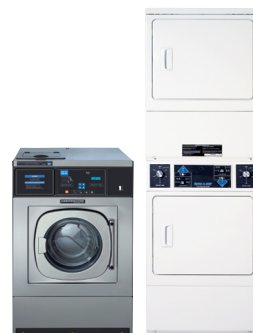
Valet Laundry & Workwear Washers, Dryers & Ironers

Provide a high-quality guest experience with industry-proven guest laundry solutions that look as good as they perform.