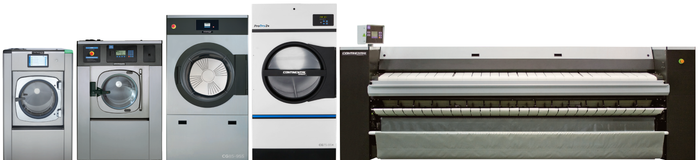
On-Premise, Central Laundry Washers, Dryers, Feeders, Ironers, Folders, Stackers Enjoy a central laundry perfectly sized to meet your property's production and quality goals.

We offer three distinctly different laundry equipment solutions for hotels and resorts: