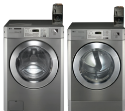
Guest Laundry Vended Washers & Dryers

Provide a high-quality guest experience with industry-proven guest laundry solutions that look as good as they perform.