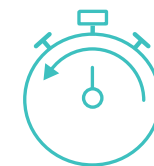
lower program times