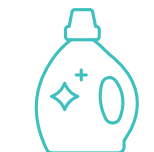
use automatic dosing