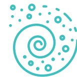
increase extract speeds