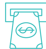
use smart vend pricing