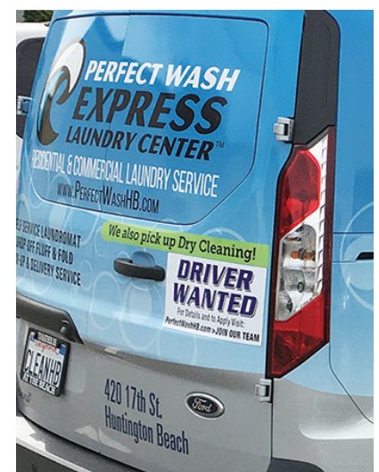
A full van wrap is ideal for advertising laundry services along pickup and delivery routes.

Please contact Kim with any questions at kloderbauer@cgilaudry.com .