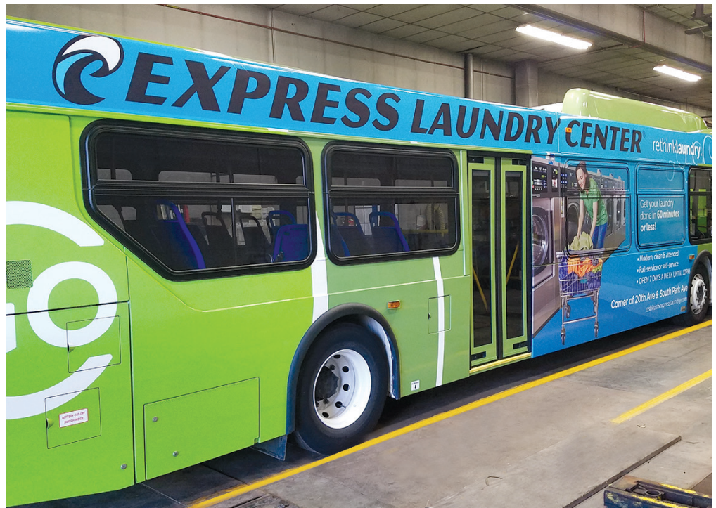
Large mobile ads can literally encompass a bus!

Less is more, especially when it comes to transit advertising. Moving ads are a quick read so keep the message simple,