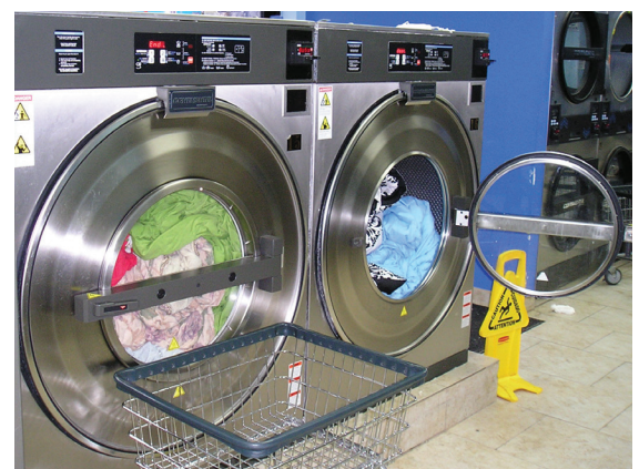
R&S Express Laundry Center provides customers with a mix of high-speed Continental ExpressWash Washers and 75-pound capacity PowerLoad Washers.