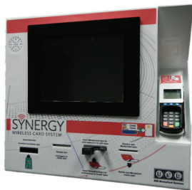
The Synergy Wireless Card System works seamlessly with Continental laundry equipment and helps nurture customer loyalty.

It's also one of the first vended laundries in the country to use the new wireless Synergy System, which was just introduced to the market. Synergy features wireless card slide readers, which are mounted to washers and dryers, an on-site server, and Value Transfer Machines (VTM). Customers use loyalty cards to operate equipment and Danza gains remote access to MyLaundryLink – a cloud-based reporting suite accessible via the Internet – to facilitate store management.