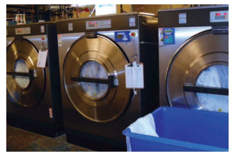
These 130-pound capacity Continental L-Series allowed the Westin Riverwalk Hotel to receive a rebate from the San Antonio Water System and dramatically cut water costs.

"We've got the washers programmed to complete a wash cycle in 45 minutes," says Rodriguez. "Laundry items come out cleaner and employees deal with far less rewash, which saves time and improves productivity."