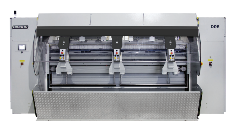
Large piece mode

The DRE is Girbau's most versatile, productive and high-speed feeder ever. It's flexible enough to feed a wide variety of item types into a corresponding ironer, while delivering superior quality results in less time.