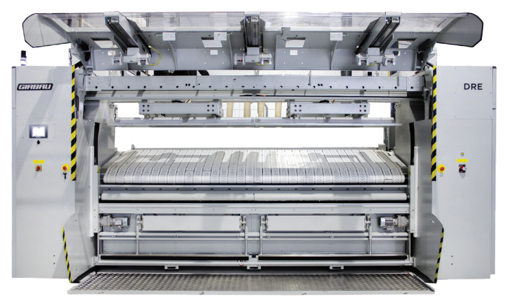
Small piece mode