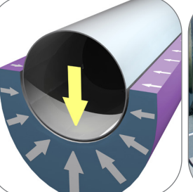
CONSTANT PRESSURE & UNIFORM TEMPERATURE