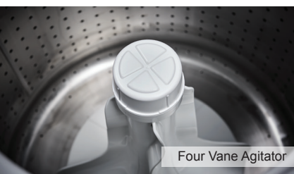
Four Vane Agitator

EconoWash owners enjoy greater features than ever before. Not only does the electronic control offer cycle and coin auditing, testing diagnostics and error code capabilities, it allows owners to program extended cycle times; choose from two agitation and spin speeds; and disable hot fills and spray rinses, if desired. In doing so, owners can improve efficiency and wash action to fit their unique needs.