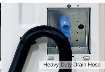
Heavy-Duty Drain Hose