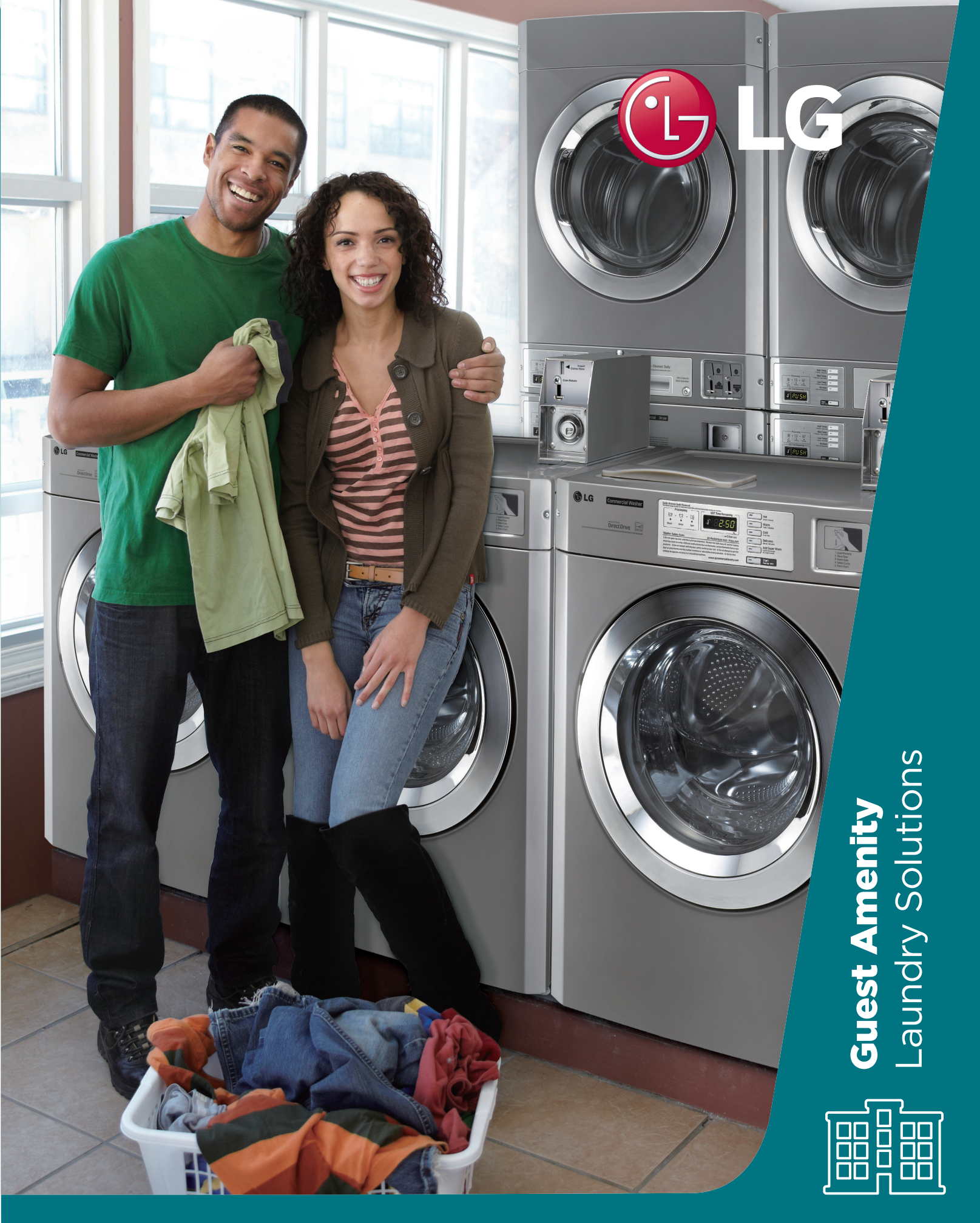
LG Commercial Washers & Dryers